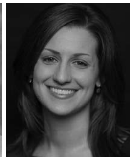
Jenny Vrentas Sports Illustrated