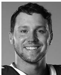
QB Josh Allen Buffalo Bills Most Improved Player of the Year