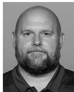
Brian Daboll Buffalo Bills Assistant Coach of the Year