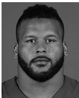
DT Aaron Donald Los Angeles Rams Defensive Player of the Year