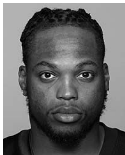
RB Derrick Henry Tennessee Titans Offensive Player of the Year