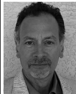
Dan Pompei The Athletic