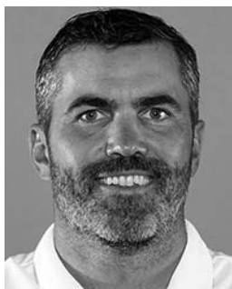
Kevin Stefanski Cleveland Browns Coach of the Year