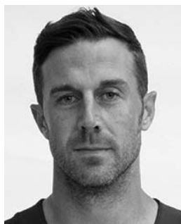
QB Alex Smith Washington Football Team Comeback Player of the Year