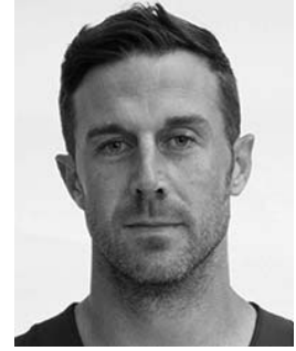
QB Alex Smith Washington Football Team George Halas Award