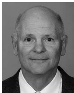
Rod Marinelli Las Vegas Raiders Dr. Z Award