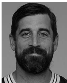
QB Aaron Rodgers Green Bay Packers NFL MVP