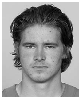
QB Justin Herbert Los Angeles Chargers Rookie of the Year & Offensive Rookie of the Year