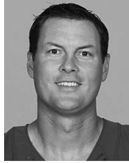
QB Philip Rivers Indianapolis Colts Good Guy Award